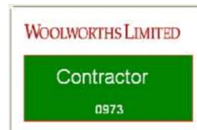
Examples of a Supermarket “Visitors Sticker”