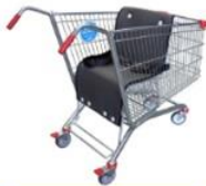
Special needs trolley