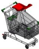
Single baby capsule trolley