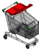
Dual baby capsule trolley